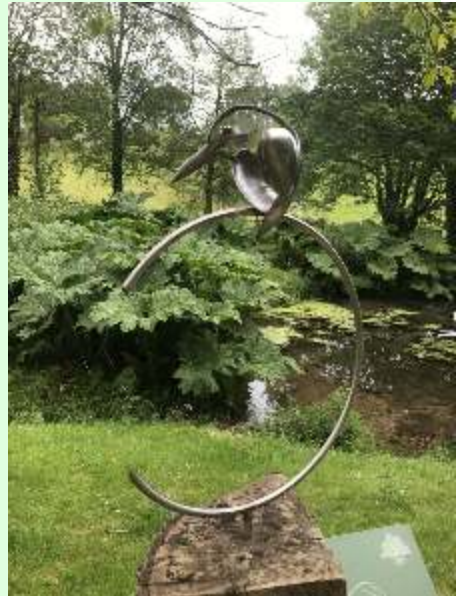
Kingfisher sculpture at Mothecombe Gardens

On May 17 th we took the Rame bus to Mothecombe Gardens for their St. Lukes charity opening. We were blessed with un predicted pleasant weather for a leisurely walk through the gardens.